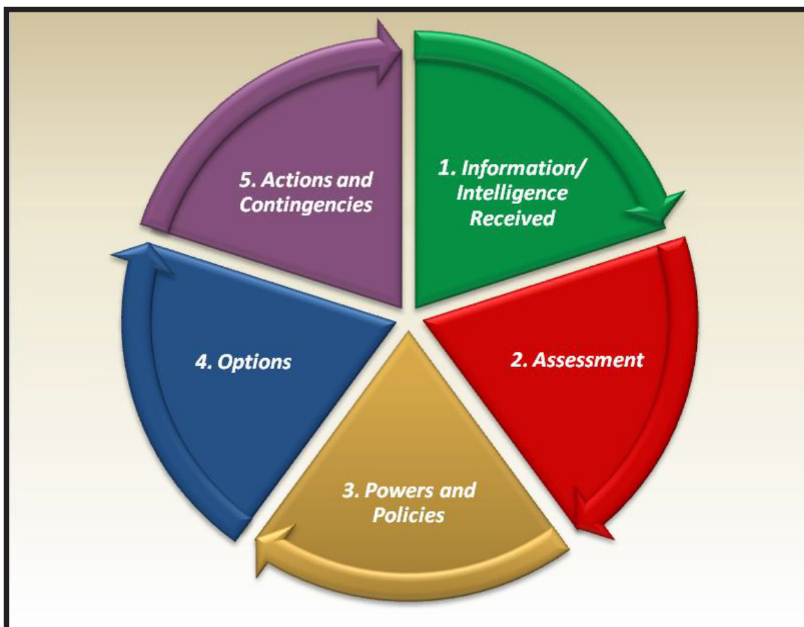
Figure 5 Garda Decision-Making Model